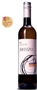
ALBARIÑO BREIZO EIDOSELA D.O Rias Baixas Albariño

The region of D.O. Rias Baixas, characterized by lowlands near the sea and river courses, showcases the fundamental influence of the Atlantic climate on the sub-regions and their wines. Bodegas Eidosela embodies a dedication to winemaking artistry, with a focus on tradition, quality, and continuous advancement in the pursuit of producing outstanding wines.