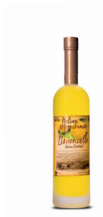
LIMONCELLO ITALIAN MOONSHINERS

Produced by an Italian family with a rich heritage of moonshine production. This cherished wine based recipe, created in 1971, has withstood the test of time and been passed down through generations.