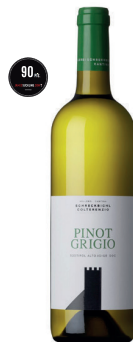
COLTERENZIO PINOT GRIGIO Alto Adige DOC Pinot Grigio